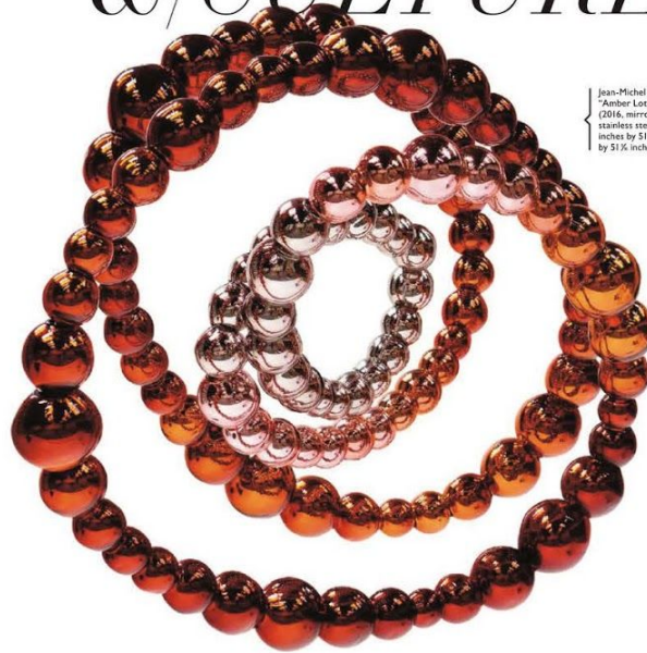
Jean-Michel Othoniel, "Amber Lotus" (2016, mirrored glass, stainless steel). 51 3/4 inches by 51 3/4 inches by 51 3/4 inches