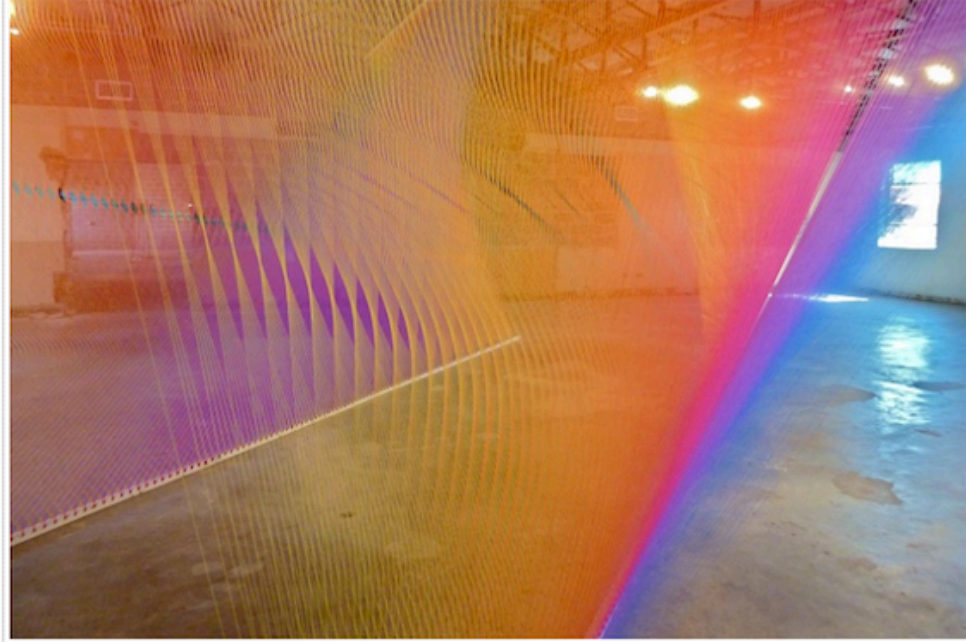
Brain Candy: Dallas Contemporary