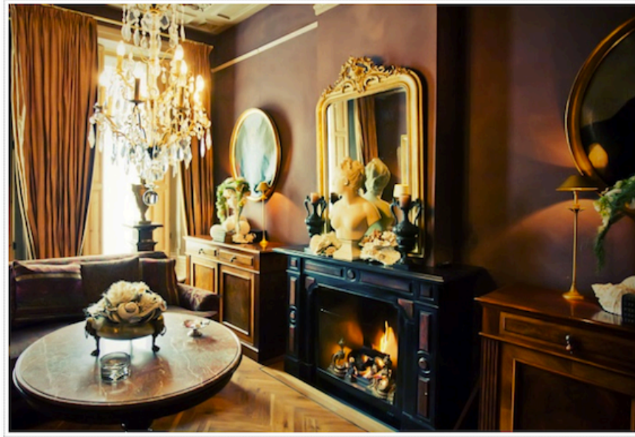
Bargain Hunter: Local Estate Sales

"I am an estate sale junkie!" she told us of her bargain hunting obsession. "I physically cannot drive past a sign without stopping." Dallas has estate sales across the city, mostly on the weekends. Our recommendation is to bring cash, shop early and join local estate sale email lists to hear about the best collections first.